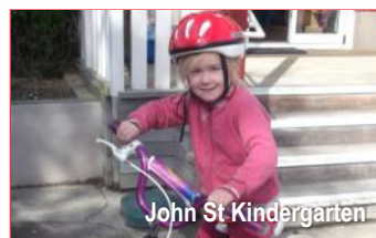
John St Kindergarten

Staff have been role modelling care and safety on the bikes and helping children to get started and to STOP!!